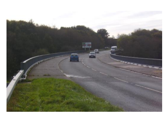
Existing Deep Lane Bridge

The Deep Lane bridge is busy with vehicles and it is not thought possible to make necessary improvements to provide a pleasant experience for cyclist or pedestrians. Hence, options to provide a new bridge over the A38 for sole use by non-motorised users are being looked at.